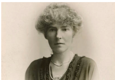
Women and Exploration