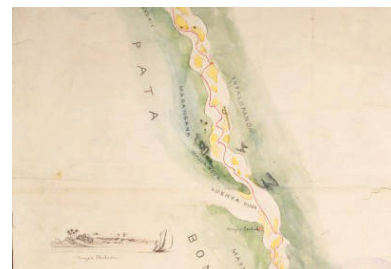
Understanding our World

The Wiley Digital Archives platform has been specifically designed to meet modern archival research needs.